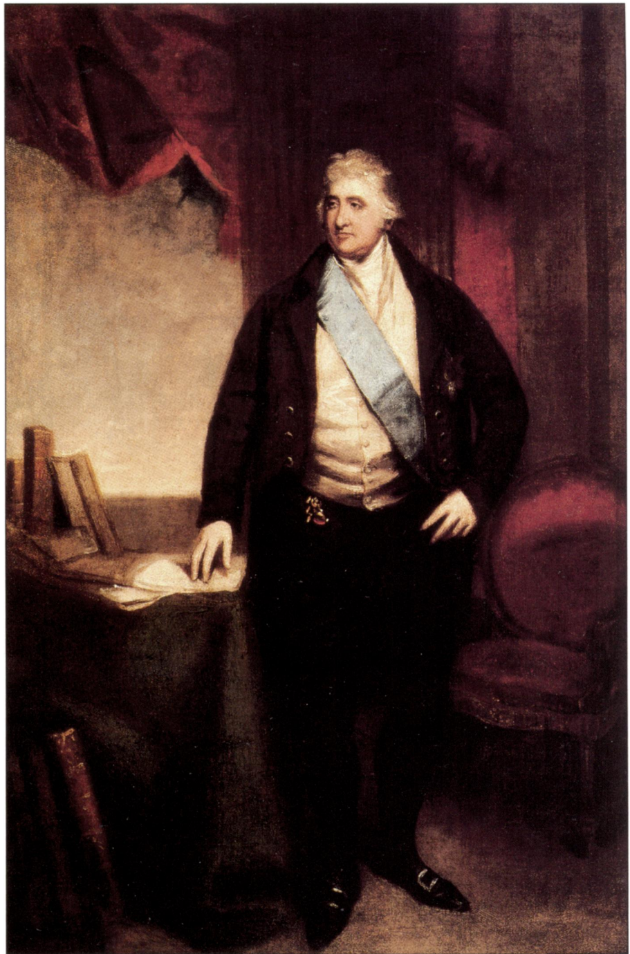
William Robert Fitzgerald, 2nd duke of Leinster by Martin Shee. The duke's bizarre offer of arms to the rebels, his acceptance of the rebel surrender on 25 July and the fact that rank-and-file participants believed that he was secretly on their side all led the government to question his role in the Maynooth rising.