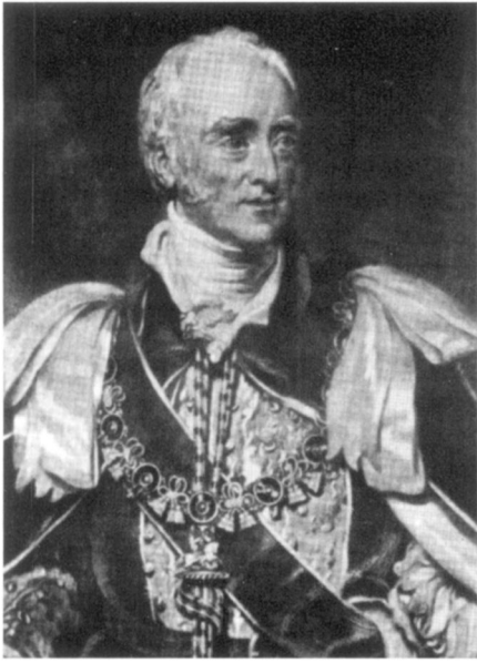
Lord Lieutenant Philip York, earl of Hardwicke.

Emmet earlier in the day were from Naas. Nonetheless, it is surely significant that over 100 rebels from the Naas area were willing to risk the journey to Dublin to participate in the rebellion.