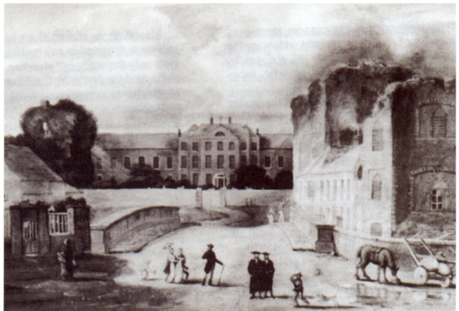
Maynooth, showing St Patrick’s College and the castle, c. 1800. Maynooth (top left of map) and Naas (bottom left) were the main centres of rebellion in the county.