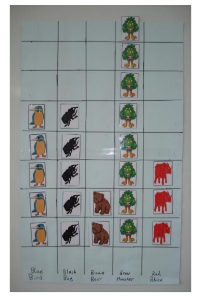
Figure 3 Figure 4