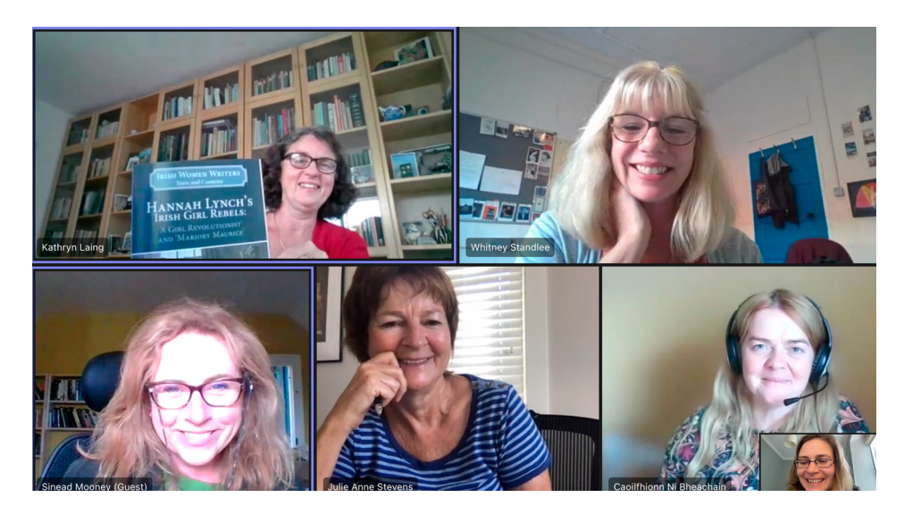
Figure 2. Six voices at home at work (23 September 2022).

to which "Staging Collaborations" operated in the context of Ireland's theatre, with studies of well-known figures such as Molly Allgood and Lady Gregory alongside the theatre's more obscured female contributors such as Dolly Robinson. Further contributions addressed the ways in which collaborations and networks enabled "Politics & Activism" (see Figure 1) and "Interventions, Interactions & Mediations", paying attention to figures such as Alice Stopford Green, the Parnell women, and Kate O'Brien.<sup>13</sup> The workshop structure of the symposium entailed probing questions that were asked of the participants, an ensuing dialogue between editors and contributors, and ultimately the invisible network of double-blind peer reviewers who influenced the finished contributions. Furthermore, this extended process of preparing the manuscript shaped the development of the new research platformed here. What started to emerge was a chorus of voices through which the sum became greater than its parts. The self-consciously collaborative approach of this contemporary network illuminates and enriches the study of past networks, collaborations and synergies in ways both tangible (events, outreach and publications) and intangible (validation through synergy).