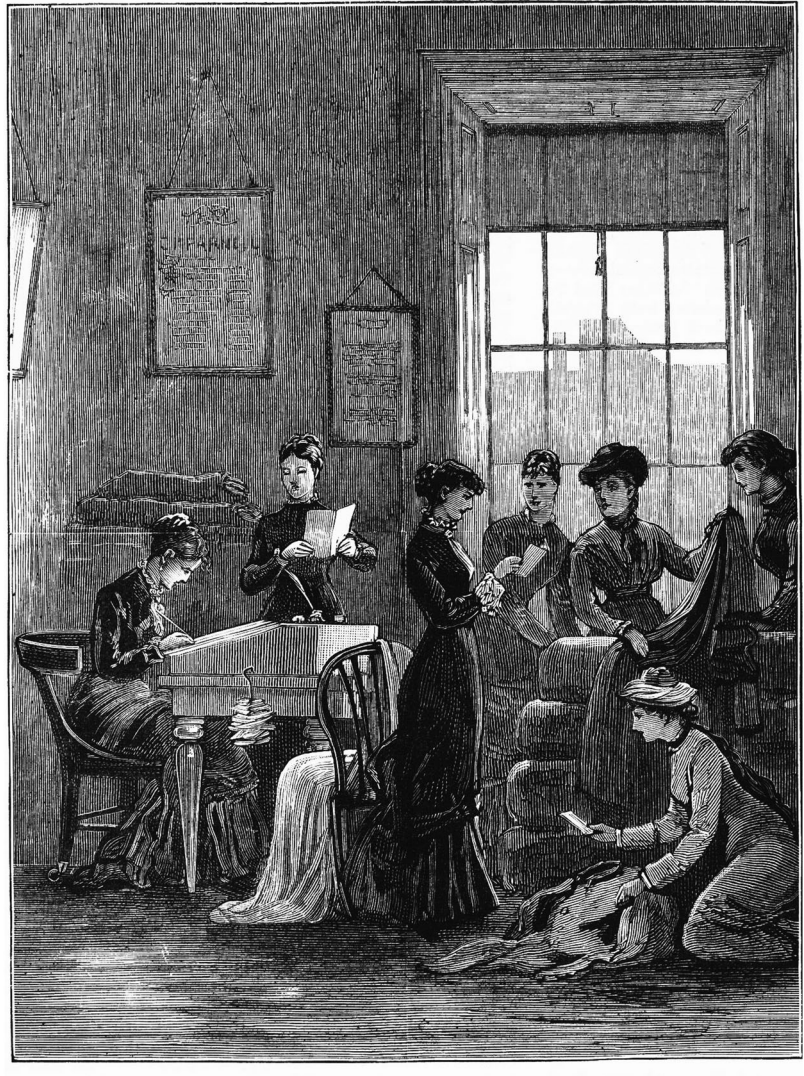
LADY LAND LEAGUERS AT WORK AT THE DUBLIN OFFICE

Figure 1. "Lady Land Leaguers at work at the Dublin office". The Graphic , November 12, 1881.