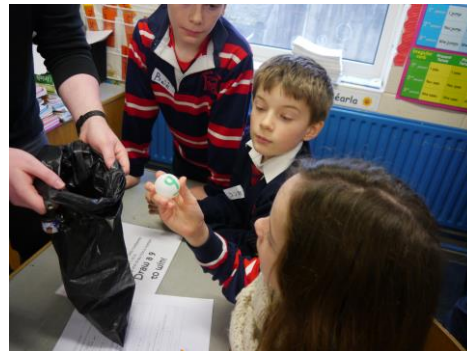
Figure 5: Lottery: Get a 9 to win

A bag is filled with 9 numbered ping-pong balls. Students must draw a 9 to win (Figure 5). They record the chances of winning (1 in 9) before making 9 draws. They then record the number of times they drew a ping pong ball with the number 9.