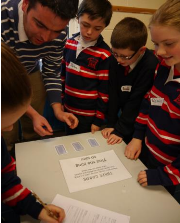
Figure 3: Find the king to win

Students calculate the probability of winning (1 in 3), play this game 3 times and record how many times that they find the King.