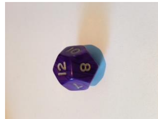
Figure 2: A 12 sided die

In this game the group roll a 12 sided die (Figure 2). They must roll a 1 to win. Students first calculate the probability of winning (1 in 12) and then roll the die 12 times and record how many times they rolled a 1.