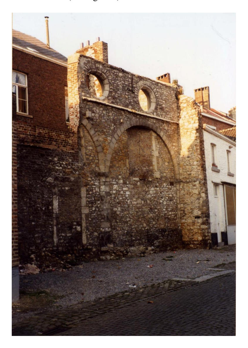
Figure 1: The only remaining wall of Église Saint-Martin d'Outre-Meuse.

the side door are clearly visible (see Figure 1). Thanks to this wall section and the plan provided by Orban, we were able to determine the location of the church choir and thus the location of the famous 'middle step' mentioned in the register. The location of the door provides the direction in which to look for the graves of the two anonymous officers. All this defines an area which, in principle, must be the location of the graves of these two officers, one of whom being most certainly Patrick Sarsfield (see Figure 2).