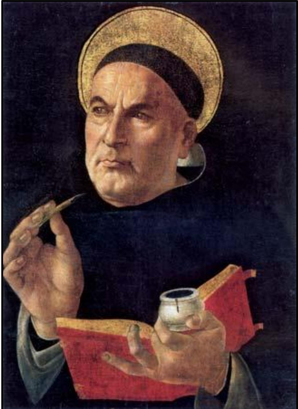
Figure 1: Sandro Botticelli's Painting of St Thomas Aquinas 798